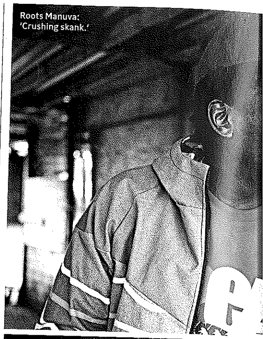
Roots Manuva: 'Crushing skank.'